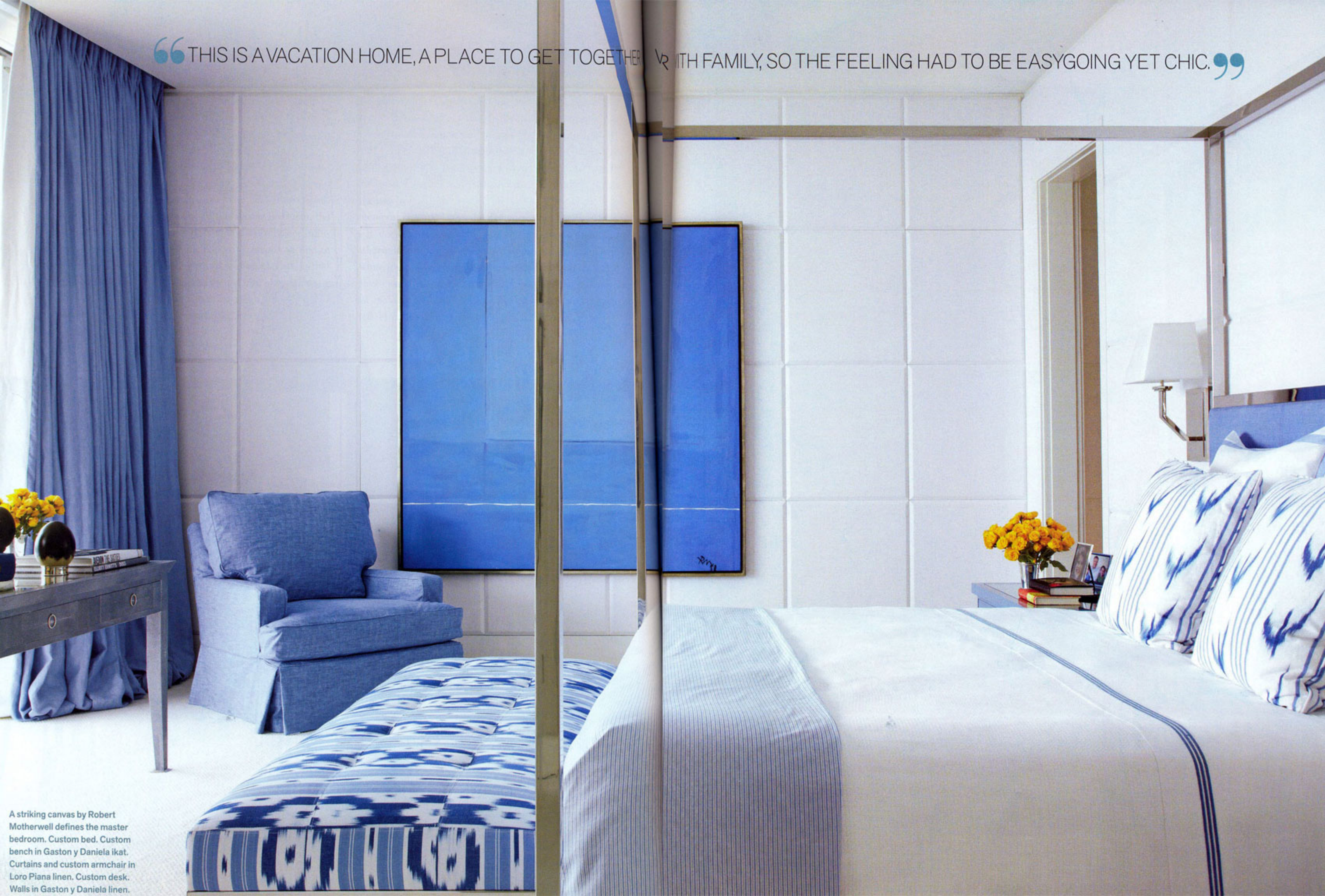
A striking canvas by Robert Motherwell defines the master bedroom. Custom bed. Custom bench in Gaston y Daniela ikat. Curtains and custom armchair in Loro Piana linen. Custom desk. Walls in Gaston y Daniela linen.

“THIS IS A VACATION HOME, A PLACE TO GET TOGETHER WITH FAMILY, SO THE FEELING HAD TO BE EASYGOING YET CHIC.”